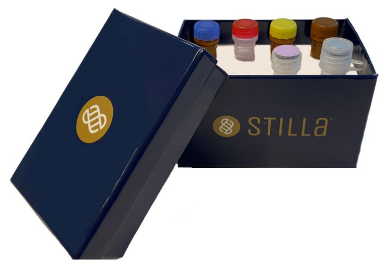
Figure 1. The naica® IQ/OQ Kit, a ready-to-use kit for the OQ of Crystal Digital PCR™ systems.

Routine OQ verifies that laboratory instruments meet specified operating criteria across the entire system lifetime. The close monitoring of equipment compliance to operating specifications helps identify possible effects due to external factors before spending valuable time and risking any impact on sample data.