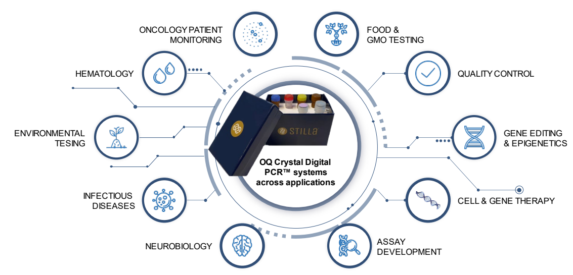
Figure 3. The naica® IQ/OQ Kit is a streamlined routine OQ solution for a wide range of key nucleic acid detection and quantification applications.

The naica® IQ/OQ Kit can be included in your OQ routine process in compliance to global standards and country-specific regulations. OQ with the naica® IQ/OQ Kit is ideal for the monitoring of the naica® system on a periodic basis in accordance with established Standard Operating Procedures (SOPs).