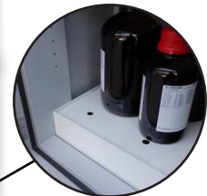
Perforated cover plate for base trough (option)