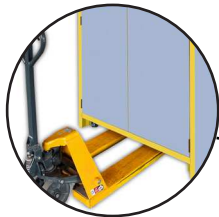
Pedestal area under-driveable