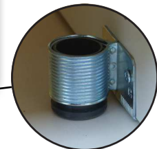
Adjustable leveling legs